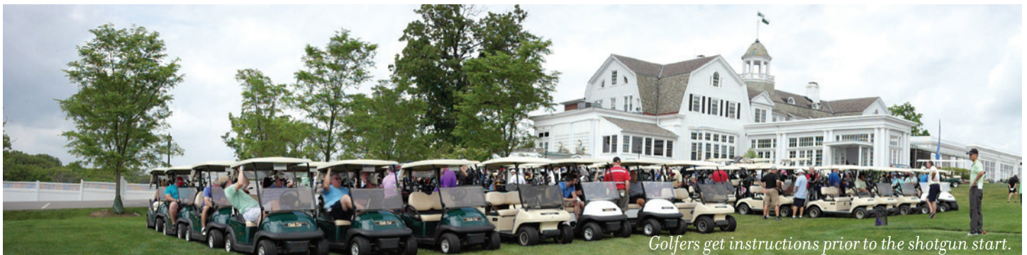
Golfers get instructions prior to the shotgun start.