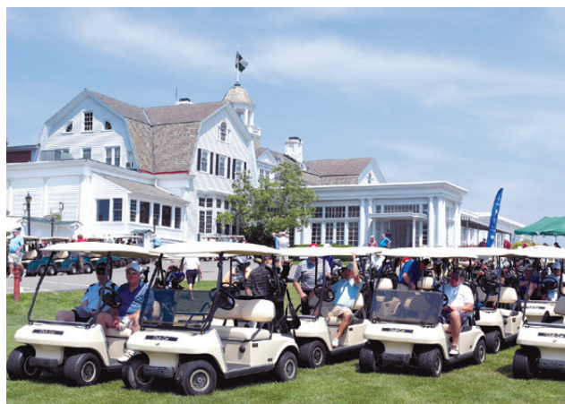
Golfers prepare for the start of the 21st Annual BHF Charity Golf Invitational on the Allegheny Country Club lawn.

A week of rain forced Baptist Homes Foundation to move its 21st Annual Charity Golf Invitational at Allegheny Country Club from its original date of May 19 to a bright and sunny day on June 23, 2014. In spite of the minor setback,